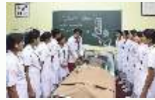
A VIEW OF IPD

out in the pathology lab for proper diagnosis of ailments.