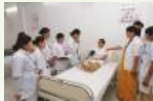
A VIEW OF OPD

Echocardiography, Dialysis and more. The Hospital has different O.P.Ds, IPD with deluxe & super deluxe rooms, private IPD wards and modular operation theatre. Five peripheral OPDs located at a distance of 5 - 10 kms cater to the medical needs of rural patients. To spread the benefits of Homoeopathy to all sections of the community, free medical camps are organized regularly. The hospital imparts medical facilities to almost 900 patients everyday which provides good clinical exposure to U.G. students, as well as interns. To offer holistic health care to the patients, physiotherapy, yoga, naturopathy & acupressure facilities are also provided in the hospital in addition to homoeopathic treatment. All routine pathological investigations are carried