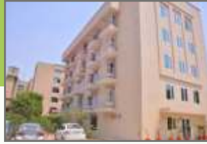
A VIEW OF BOYS HOSTEL