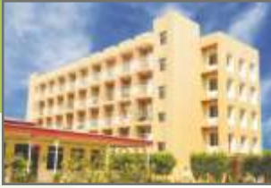
A VIEW OF GIRLS HOSTEL

Separate hostel facilities for boys and girls are available in the college premises.