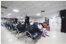
A VIEW OF OPD WAITING LOUNGE