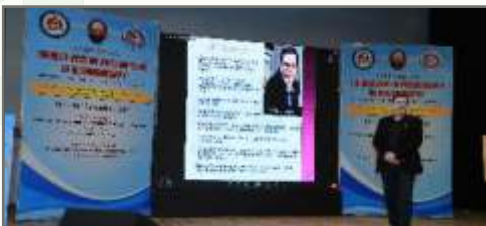
INSPIRATIONAL SEMINARS BY LEADING HOMEOPATHS

The placement cell of the college aims at providing guidance to the students about career opportunities and is engaged in conducting campus recruitments.