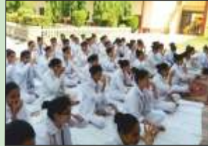
A VIEW OF YOGA UNIT