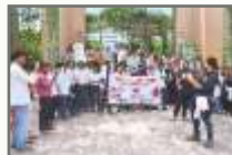
WORLD HYPERTENSION DAY