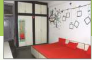
INSIDE VIEW OF HOSTEL ROOM